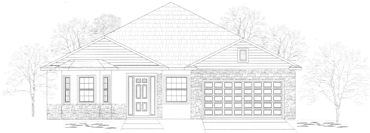
The Emerald Model 3 Bedroom, 2 Bath Den, 2 Car Garage